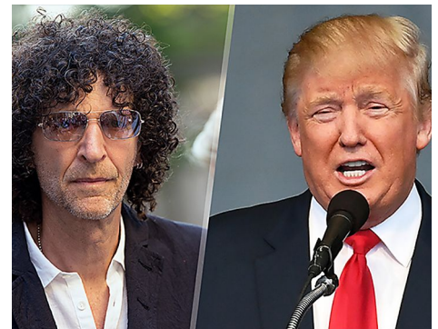
Howard Stern was 100% right about Donald Trump CNN Money: Media