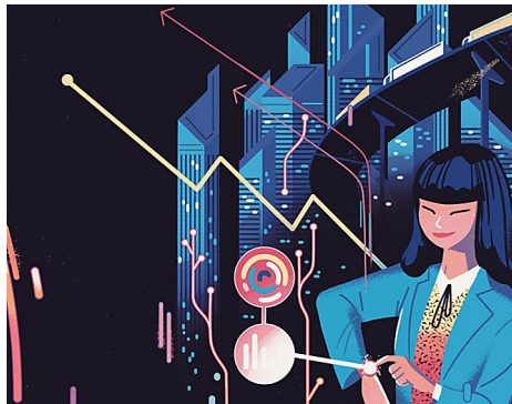
Deloitte: How digital will help India leapfrog development hurdles Deloitte University Press