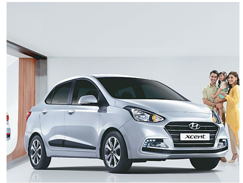
The Stylish Family Sedan of 2017 Starting only @ 5.38 Lac www.hyundai.com