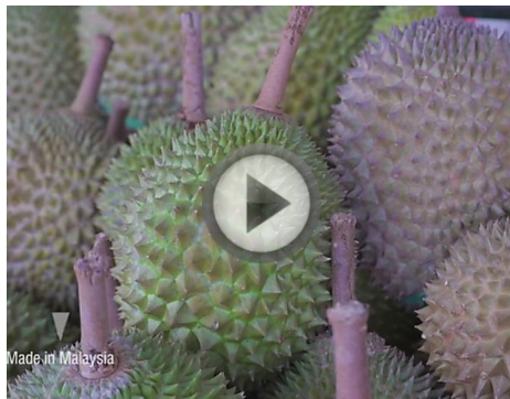
Is this the most abused fruit? CNN Money